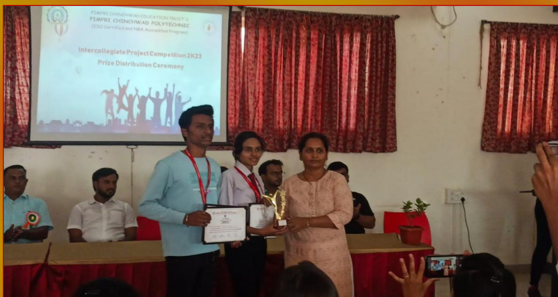
Students attended Project Competition at Pimpri Chinchwad Polytechnic