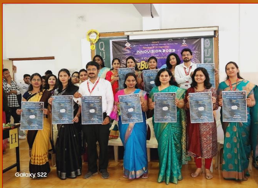
Quiz Buzz 2K23 on 24/03/2023