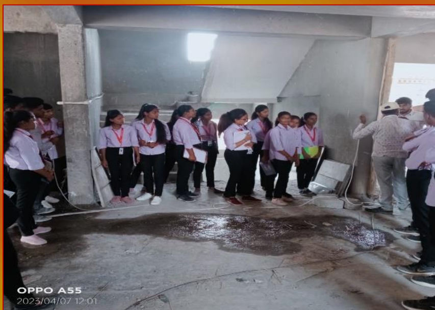
Visit to Vermi Composting Plant, Ganeshkhind on 07/04/2023