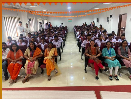
Marathi Bhasah Divas Celebration on 27/02/2023